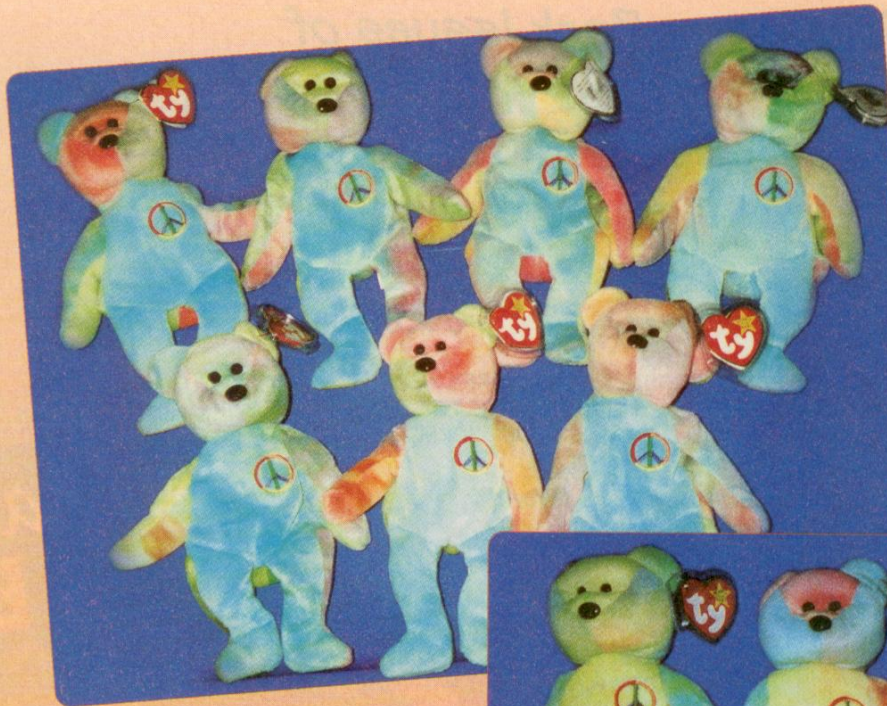
A sampling of some of Gaughan's odd-colored Peace™ bears boasting dominant blue (above), yellow (center) and pink hues.